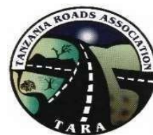
Tanzania Roads Association (TARA)