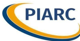
World Road Association (PIARC)