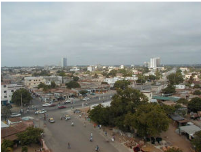
General view of the city of Lomé