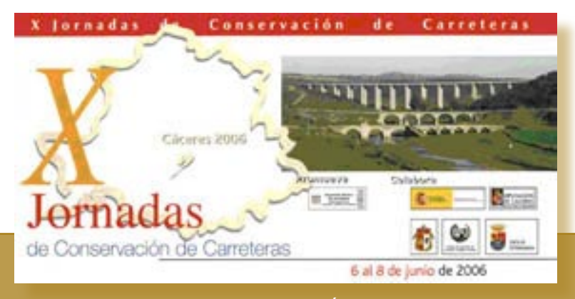
6-8 June 2006, Cáceres

The Road Technical Association, PIARC's Spanish National Committee, will hold the 6<sup>th</sup> Vial Security National Conference, in Seville.