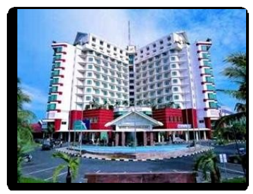
Corporate Rate : Superior, US$ 70

Publish Rate : Superior, US$ 80 Deluxe, US$ 96