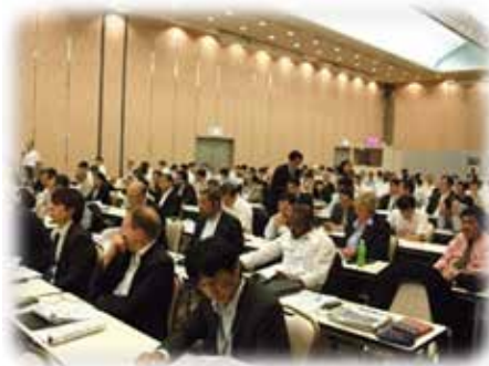
OSAKA, May 2013